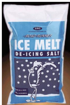
10BRR / 10# Bag GOOD