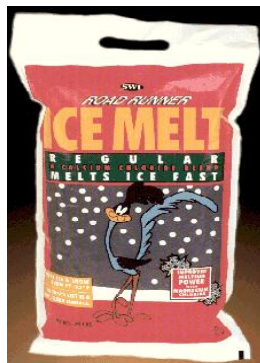
20BRR / 20# Bag BETTER