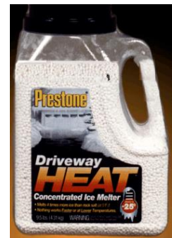
20BRR / 20# Bag BEST