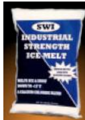
50BIND / 50# Bag BETTER