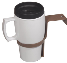
KH 01 Economy Cup Holder