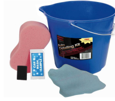
PS 4A 11 QUART BUCKET KIT