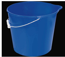
PA 11 11 QUART BUCKET