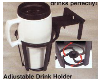
Adjustable Drink Holder KH 02 Expanding Cup Holder