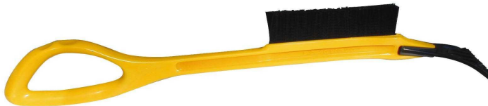
CA 96 26" ERGO SCRAPER-BRUSH

Detailed Designs™ A Division of Injectron