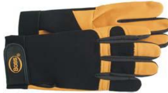
4048 Gold goatskin palm w/ black spandex back & loop and hook fastening system cuff Sizes: Large & X-Large