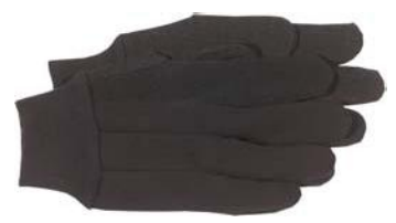
J133 4024 Jersey, plastic dot palm, knit wrist