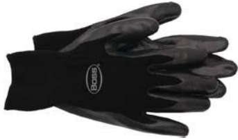
8436 Black nylon knit with nitrile palm & fingers, nylon knit wrist Sizes: Medium & Large