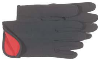
J132 4027 Slip-on style red flannel lined jersey