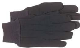
J124/903 4020 8 oz. Jersey, knit wrist