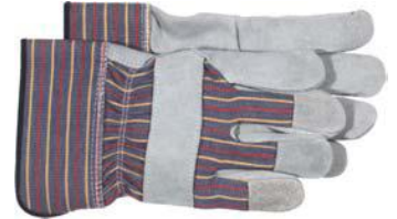
4094 Shoulder split leather palm, safety cuff Sizes: Large