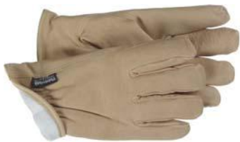
4191 Thinsulate Insulation grain pigskin Sizes: Large