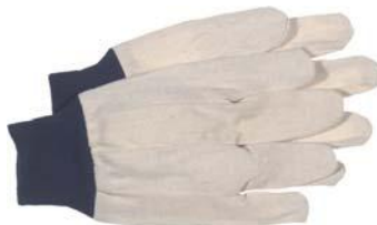
C102 4001 Poly/Cotton, knit wrist