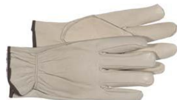
U384L Grain Leather